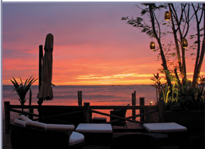
Sunset view at Casa Rolandi.