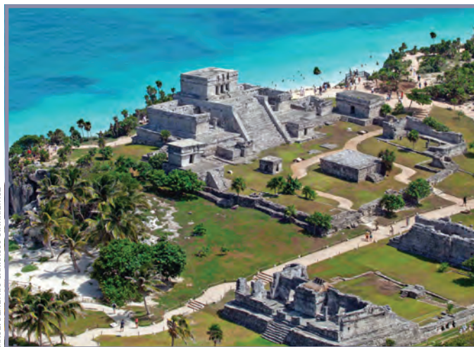
Mayan Ruins, Tulum, Quintana Roo.

And so the resorts themselves. AMResorts, North America's fastest-growing luxury leisure resort company, is located throughout Mexico, the Dominican Republic and Jamaica. Services are provided to five brands comprising the luxury collection of resorts: Zoëtry Wellness & Spa Resorts, Secrets Resorts & Spas, Dreams Resorts & Spas, Now Resorts & Spas