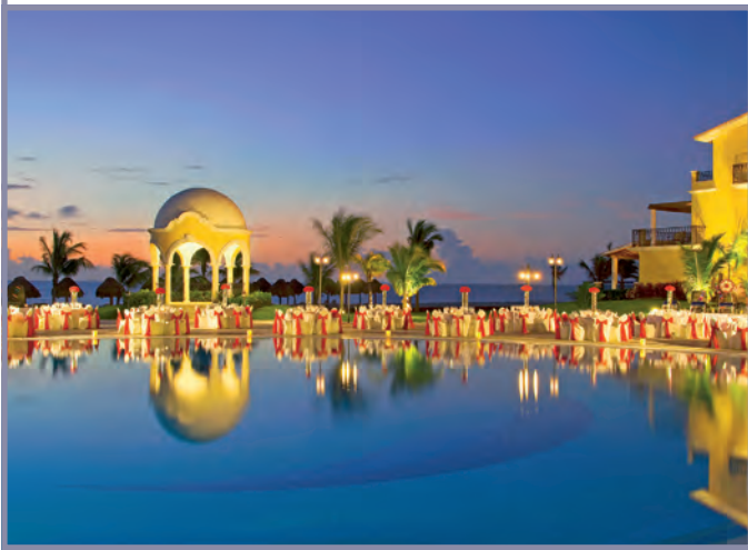
Secrets, Capri Rivera Cancún, AMResorts.

"With regard to people wishing to start a new business, Quintana Roo government has sponsored nine facilities to incubate them until they are able to compete on a larger level. So we are trying to generate 400 new companies a year with this program, called Emprende .