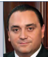
Roberto Borge Angulo Governor of Quintana Roo

"We are going to consolidate the cultural sites in each area with the coastal regions and strengthen the quality of what we offer. We are going to develop the infrastructure as well.