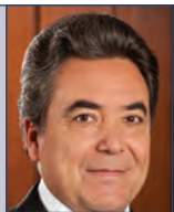
Jorge Torres López Governor of Coahuila de Zaragoza

development plans. Well-connected, a flight from Mexico city from Tabasco's capital Villahermosa is just one hour, and is one of the main access points to the southeast area of the country.