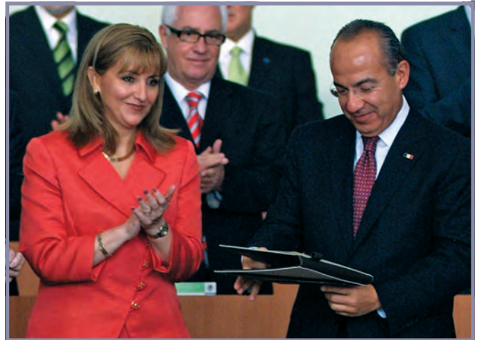
Minister of Tourism Gloria Guevara Manzo and President Felipe Calderón Hinojosa.

New flight announcements from Continental Airlines, United Airlines and Delta Airlines increased hotel capacity and the fact Mexico has the highest number of luxury hotels in the world, after Italy, will continue to bring visitors flocking in. The vast range of tourism attractions located within a host of very different but equally alluring provinces, looks set to raise Mexico's profile in the coming years, with state governors and government officials unanimous and committed to the sector's potential as a growth driver.