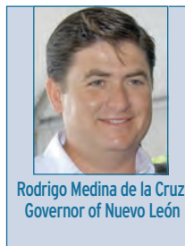
Rodrigo Medina de la Cruz Governor of Nuevo León

Such successful economic diversification is built on several strong foundations, including political and social stability, modern infrastructure, a pro-business climate, a world-class