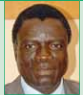
Maxwell Mwale Minister of Mines