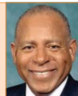
Patrick Manning Prime Minister

Minister of Foreign Affairs Paula Gopee-Scoon sees the CARICOM Single Market and Economy (CSME) as an unparalleled economic opportunity for both local and foreign investors alike. CARICOM produced goods can be traded among the participating Member States with a population of approximately 6 Million people without attracting Taxes and Duties. "It is the most effective vehicle for enhancing regional