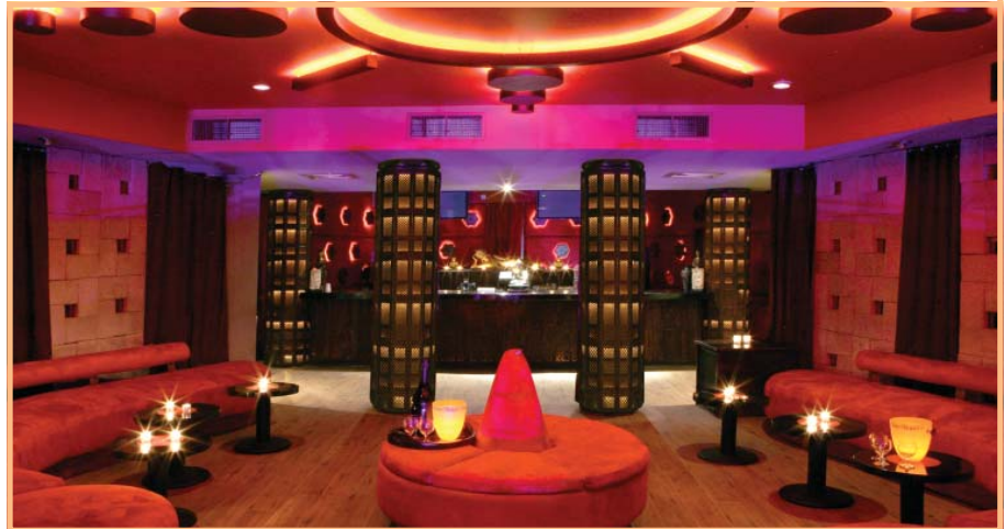
Experience the art of clubbing excellence at the world famous Zen. www.zen.tt