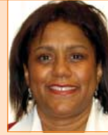
Paula Gopee-Scoon Minister of Foreign Affairs