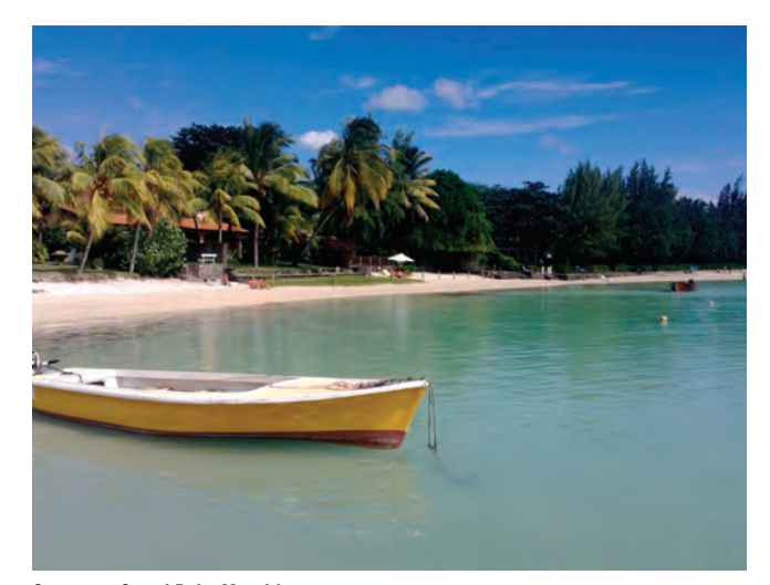
Cove near Grand Baie, Mauritius

and serving the nation. We have managed to get back on the path toward recovery and sustained profitability without any bailout."