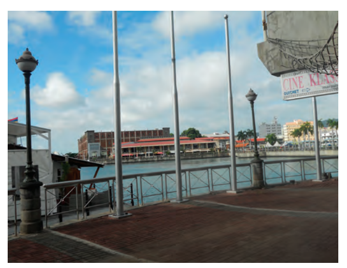
Le Caudan Waterfront , Port Louis, Mauritius

Salient features of the plan include terminal extensions to cater to up to 10 million passengers, the construction of a second runway, a