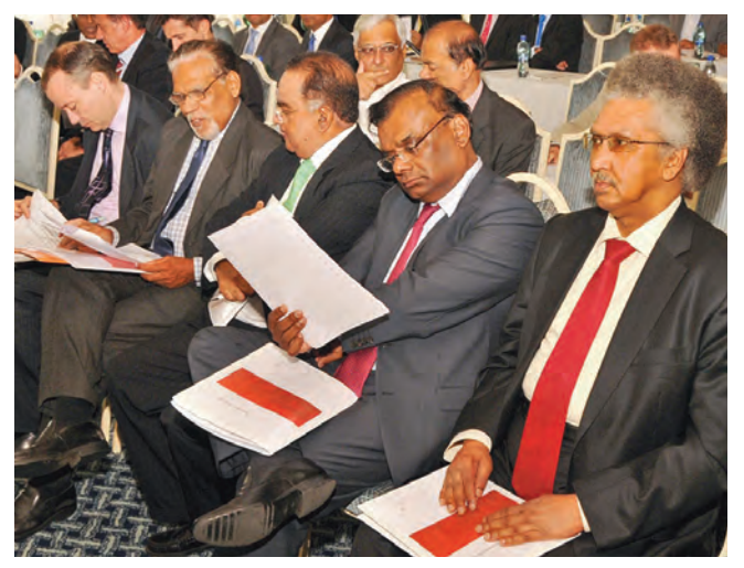
Front row of the Business Outlook leadership series forum

"Our port provides a very safe, quick and efficient transshipment